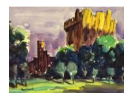
"Blarney Castle"