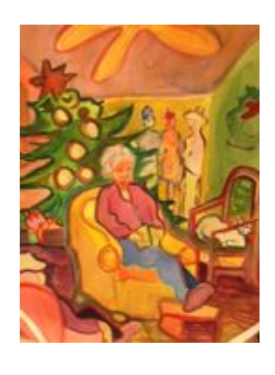
A Christmas Interior by Emmy White