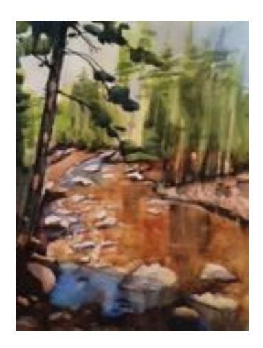
A landscape by Vera Kovacovic