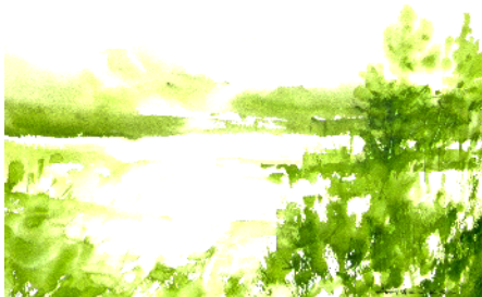
Value study in sap green.

Art teaches Watercolor Foundations at the Minnetonka Center for the Arts. He starts the class each week with an easy exercise designed to understand color theory, water/pigment ratios, brush dexterity, value studies,