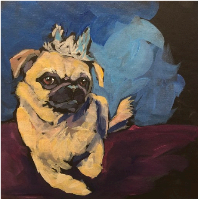
Kat Corrigan, "The Princess," acrylic