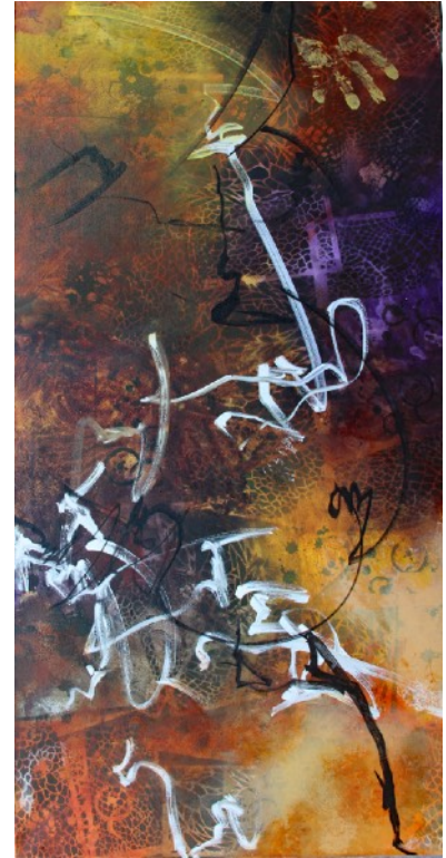
Calvin deRuyter, "Contact," mixed watermedia