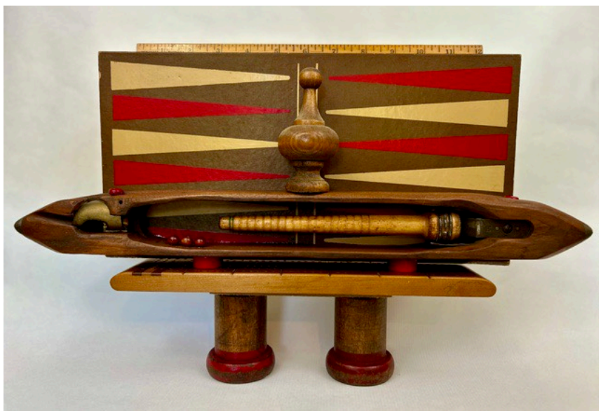
Sandy Parnell, "Playful Patterns," assemblage