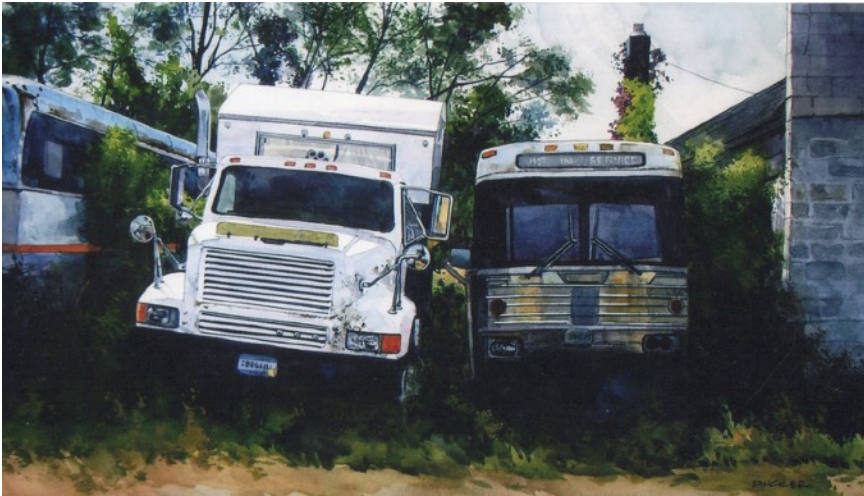
Fred Dingler, "Out of Service," watercolor