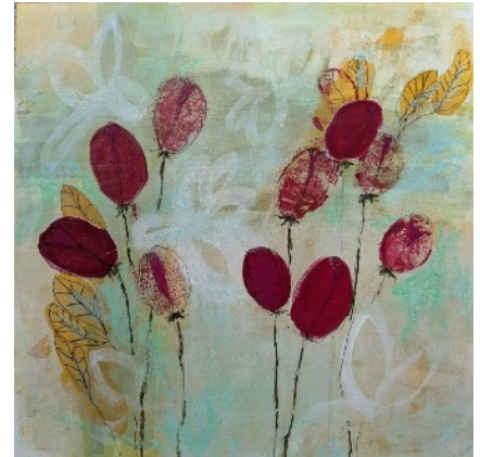
Nan Foker, "Wistful Autumn," mixed media collage