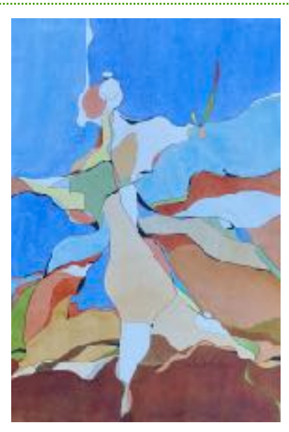
Joyful Watercolor Sonja Hutchinson