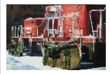
Soo Line Snow Plow Watercolor Fred Dingler