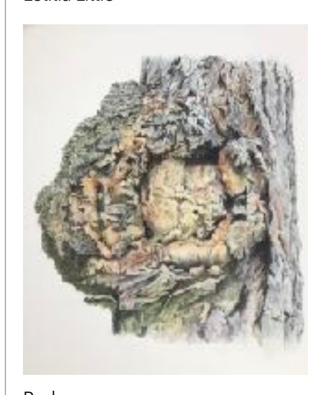
Burl Watercolor Ronda Dick