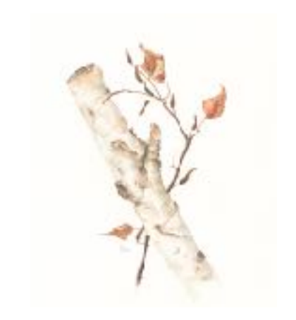
Winter Birch Watercolor Lynne Hagen