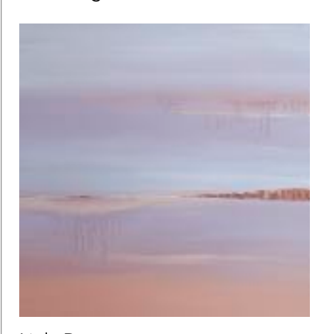
Little Desert Acrylic Letitia Little