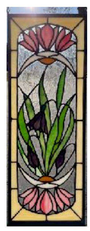
Spring Flowers Stained Glass Sushila Anderson