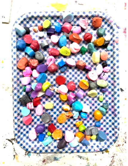
Polymer clay for our use

We learned a little about Layl; who knew she made a full-size buffalo out of clay and found objects?