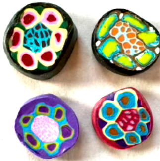
A collection of our "flowers."